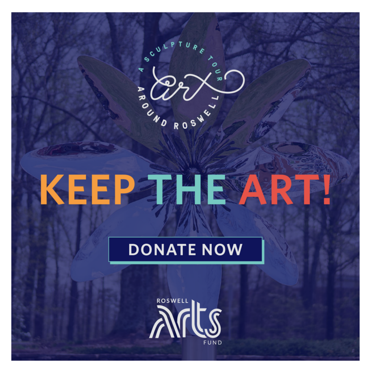
August 9, 2017 – A campaign to Keep the Art! has received a tremendous boost, thanks to a generous challenge by the Roswell Downtown Development Authority.

Keep the Art! Roswell Downtown Development Authority Challenges Community to Match $10,000 Donation