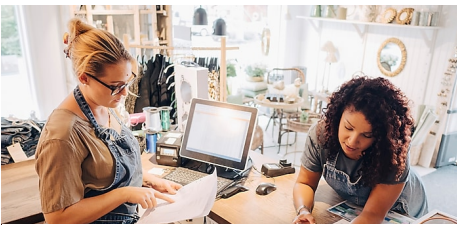
By Wells Fargo - Member FDIC.