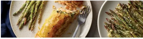
ADVERTISER CONTENT: Publix

A special evening tour is in the works to accompany the First Friday Art Gallery Walks that begin in May. And as Roswell is now home to a handful of home-grown craft breweries, “Brewery and Art Walks” will also be on tap. The Roswell Adult Recreation Center on Grimes Bridge Road is planning a tour for seniors, and children can join the Recreation and Parks Summer Camp program tour. The guided tours will continue beyond the spring and summer and into October, for National Arts and Humanities Month.